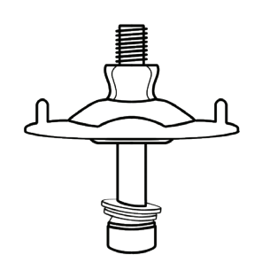
B) S.A.C.H FOOT ADAPTER